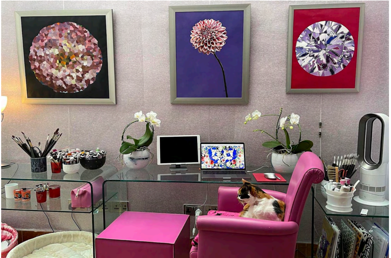
Bettina Newbery, STUDIO workspace 2023. Courtesy VISIONAIRE LONDON ®