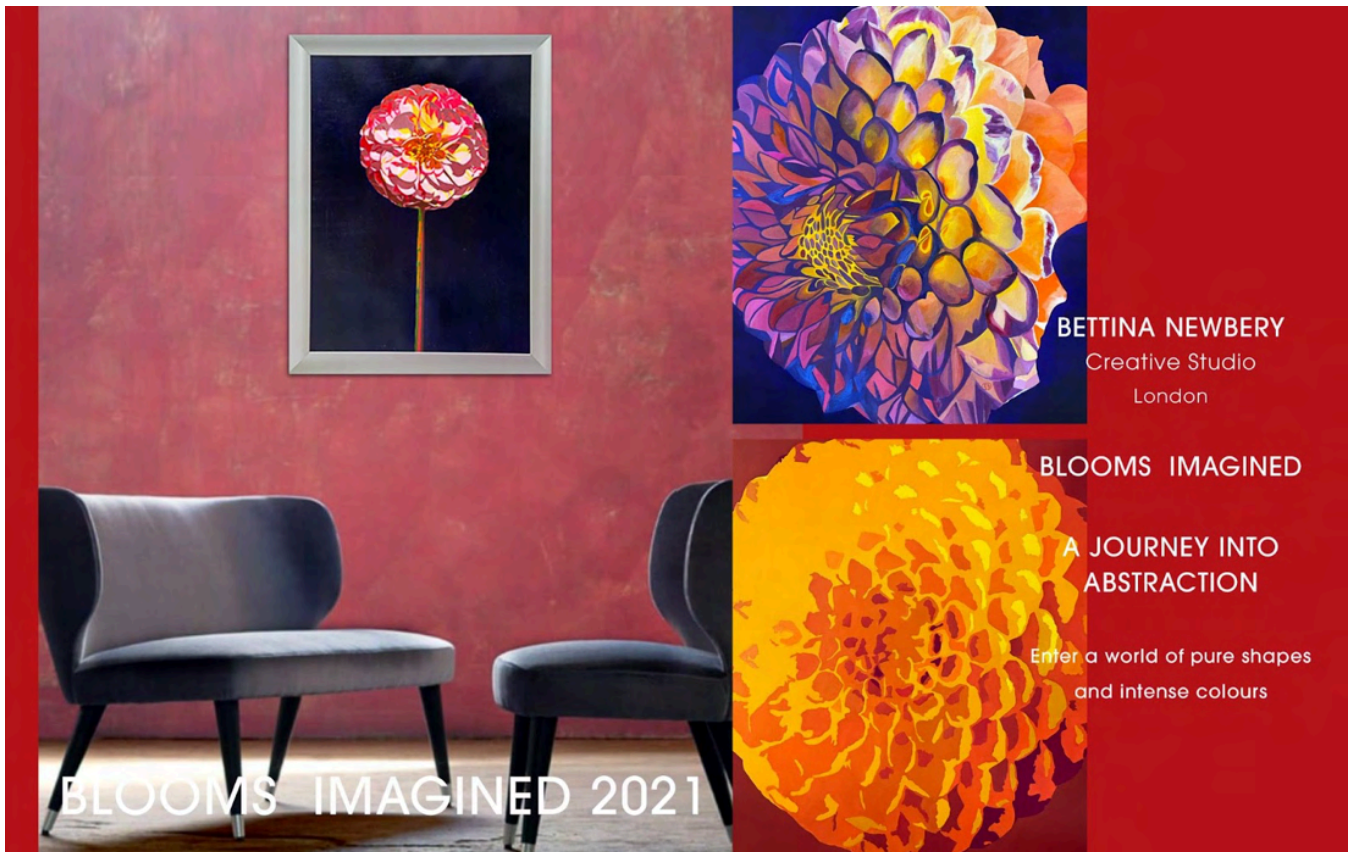
Bettina Newbery, Blooms Imagined, 2021.

Related Articles: In conversation with VISIONAIRE LONDON®.