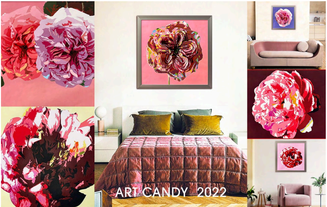
Bettina Newbery, A selection from Art Candy, 2022. Courtesy VISIONAIRE LONDON ®

K: What are your next projects within and without the gallery Visionaire London?