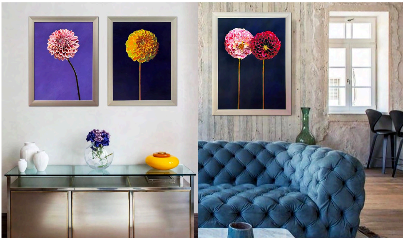
Bettina Newbery: BLOOMS LILY + SHIRLEY, JILL + JASMINE from Blooms Imagined, 2021.

The ray florets of beautiful luminous bloom Lily range from subtly streaked with creamy white and pale lilac-pink to a sumptuous apricot-pink and a warm golden peach pairing so decoratively with glorious Shirley in a warm blend of rich gold and warm copper.