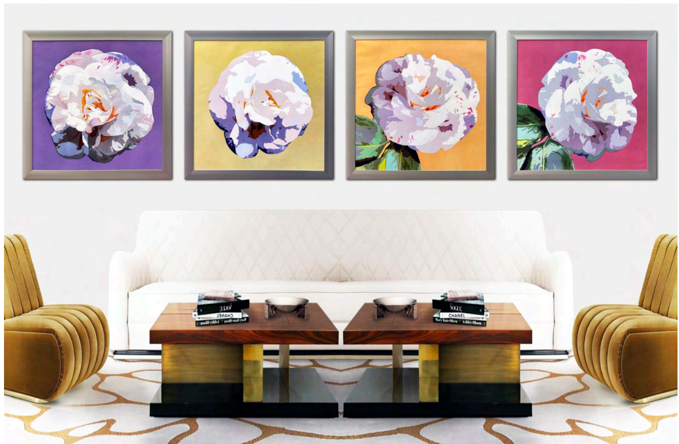
Bettina Newbery: BLOOMS CLEO, ROSALIE, ALYSSA, MAGGIE from Blooms Imagined, 2021.

Jill + Jasmine add sumptuous colour to your living or work space with lavish-looking blooms: well-formed lilac-pink soft petals pair with a neatly symmetrical, claret black flower ball that adds a bold shot of rich colour.